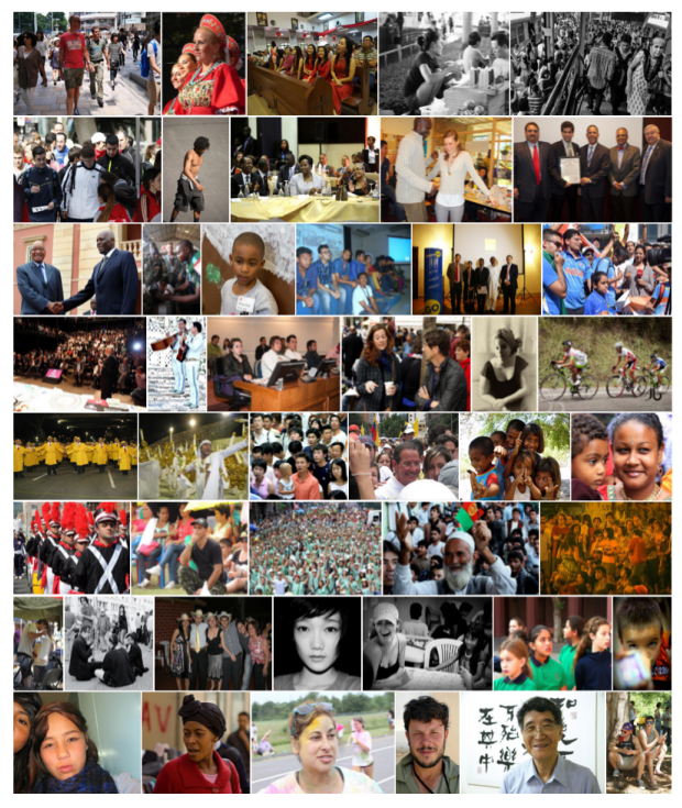
Figure 2. Random selection of images from the Faces of the World dataset

3. Post-processing: After the annotation process had finished, faces were extracted from the images using the bounding boxes provided by the Face and Gender Detection workflow. The training (5,651 faces), validation (2,826 faces) and testing (4,086 faces) set of the Faces of the World (FotW) dataset were created. Table 5 shows the annotations corresponding to the Accessories classifications.